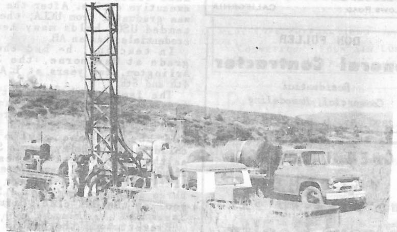
One of our modern rigs at work in Alpine.